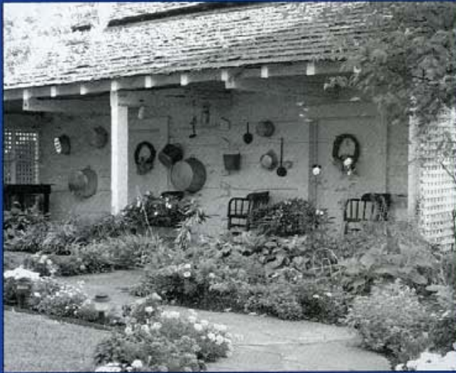
(1826) Beaty Mason Slave Cabin