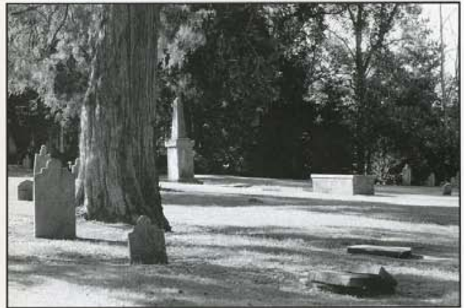
(3) Old Athens Cemetery