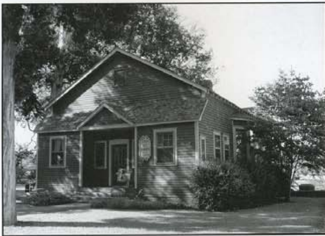
(6) The Scout House

6 313 E. Washington - The Scout House. This house was built in the 1930's for Girl Scout Troops at far less than $1000. It now houses the Athens City Board of Education.