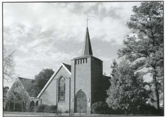
(45) St. Timothy's Episcopal Church

44 202 E. Washington (ca. 1912) Frost-Gates/Beard Grayson-Scott Interiors has recently been restored. Beveled glass in the doorway reflects the beauty of the interior. This former residence now houses a business. Go in for a visit.